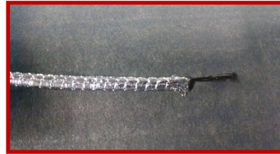
Inconel® can be clearly seen knitted around each individual yarn

Slade utilizes Inconel® 600 as a knitted jacket around our patented carbon reinforced yarns. Slade's unique design allows the Inconel® to become an internal skeleton providing strength and stability with out damaging equipment.