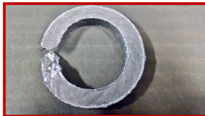
Once die formed, the Inconel® knit is no longer easily visible due to the carbon fiber strands pushing out the graphite up and over the Inconel®