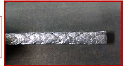
After packing is braided and calendared to size, Inconel® knit becomes less visible as the graphite is pushed out through the Inconel®